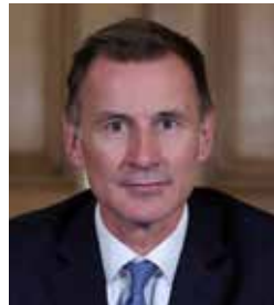
Official portrait of Jeremy Hunt MP

Some of the rumours, such as IHT reform, did not come to fruition, but there is still a chance – the Spring Budget is now less than four months away.