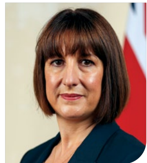
Official portrait of Rachel Reeves MP

Other significant tax increases included higher capital gains tax rates and a future reduction in inheritance tax business and agricultural reliefs. Despite the additional revenue, the Office for Budget Responsibility (OBR) projects that increased spending will mean that borrowing will still be over £70 billion in 2029/30. Not without reason does the OBR say, “...this Budget delivers a large, sustained increase in spending, taxation, and borrowing”.